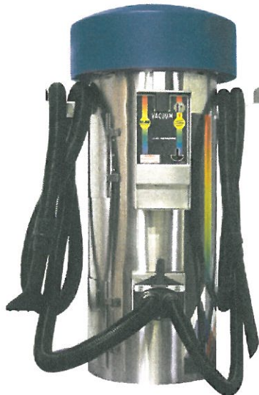
SUPER VAC 9210LD SHOWN WITH 4015KIT DUAL HOSE ADAPTER