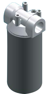
450 w/50032 Adaptor