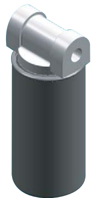
250E w/50003 Adaptor