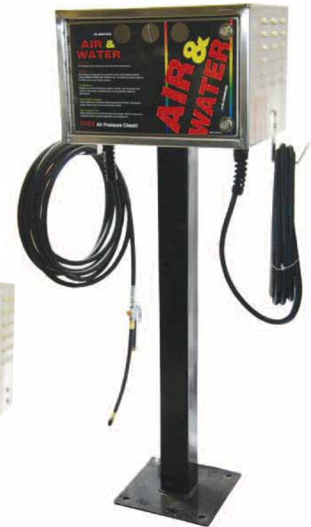
8685-2GW AIR & WATER MACHINE ON OPTIONAL 8819-50 PEDESTAL (SOLD SEPARATELY)