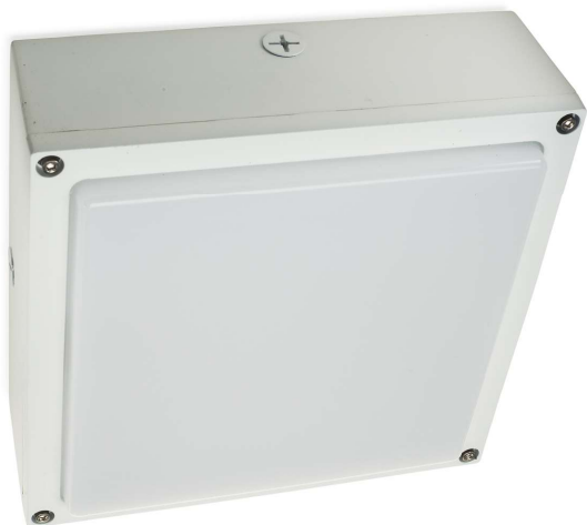
(polycarbonate drop lens)