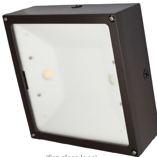
(flat glass lens)

These slim surface mount lights are perfect for stairwells and passageways, low bay lighting, parking garages, under canopies, and gas station canopies. Both finishes are available with either a flat glass lens or a polycarbonate drop lens.