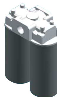
800BMG w/Dual Adaptor