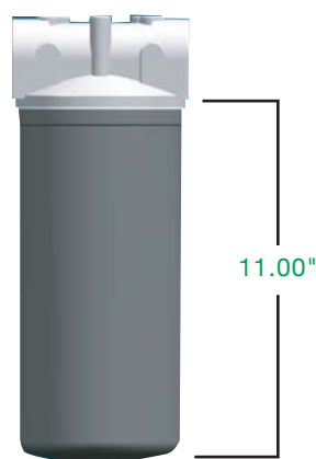
800BMG w/Aluminum Adaptor