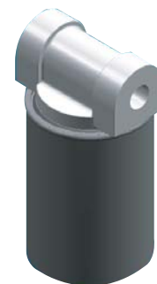
300MB w/50003 Adaptor